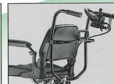
Attendant control handle (optional)