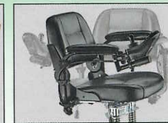
Swivel Seat (optional)