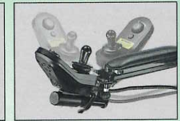
Swinging away joystick (optional)