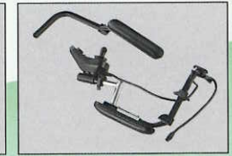
Joystick & Armrest